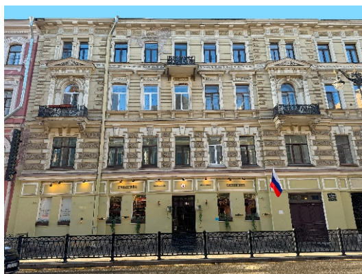
School Building, Rubinshteina str. 11

ProBa Language Centre established in 1995. At present ProBa is one of the leading institutions offering academic courses of the Russian Language for Foreigners and intensive language practice in Russia.