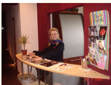
Our hostel. Reception.